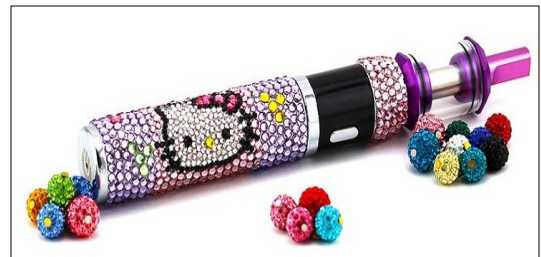
Hello Kitty e-cigarette shows how they are marketing to our youth.