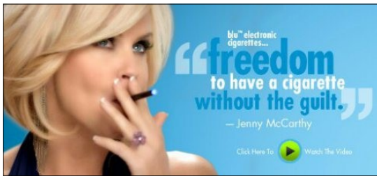
Actress Jennifer McCarthy advertising for one brand of electronic cigarettes on the market.

The 2013 ND Youth Tobacco Survey showed that 13.4% of high school students have reporting ever trying an e-cigarette.